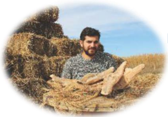
Farmer & Processors