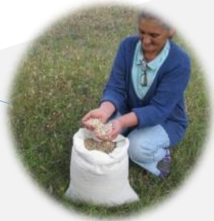
Small Farmers - grain production