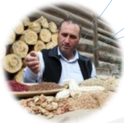
Large Farmers - primary & flour production